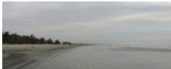
Baobab Trees and Coasts