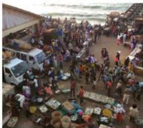
Fish market, Bakau